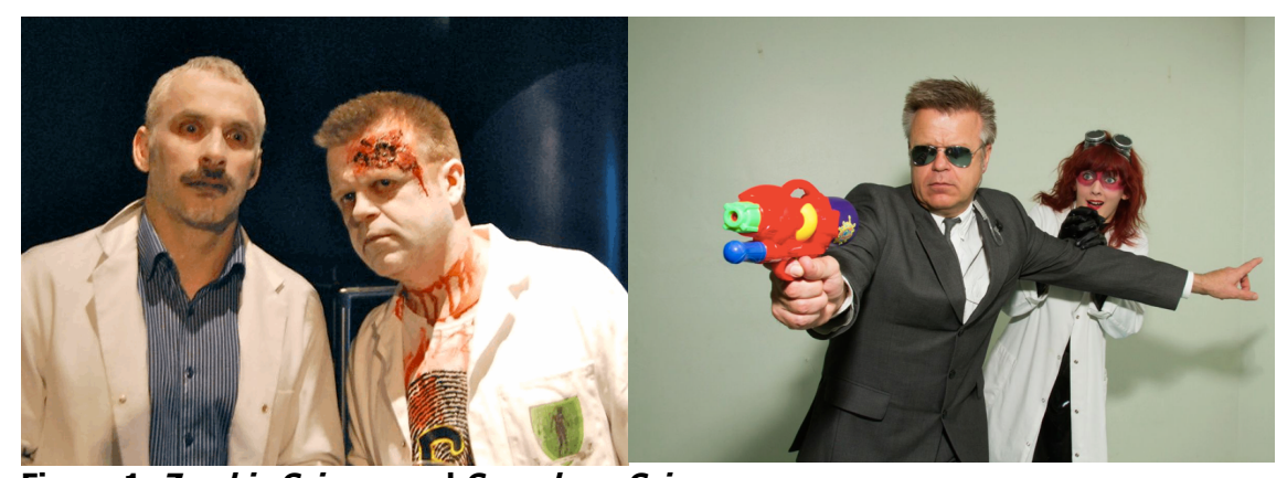
Figure 1: Zombie Science and Superhero Science.

When rewriting the problem sessions, I decided to focus on three of the most important, but sometimes neglected, aspects of bioscience teaching, data-analysis, problem-solving and experimental design. I took inspiration from several sources. My favourite childhood book was You Are the Ref! , a comic book approach to learning the rules of football using various plausible (and some rather less plausible) short stories. I've also undertaken lots of Public Engagement work with Glasgow Science Centre (REF1) and have become a great fan of their Inspire & Challenge approach. In addition, I've spent much of the last ten years working with Time-Tastical Productions on our Wellcome Trust funded comedy science shows Zombie Science (REF2) and Superhero Science (REF3). We use a storytelling approach to engage children, teenagers and young adults. Images from the shows, which have been seen by 80,000 and 20,000 people respectively, are shown below (see figure 1).