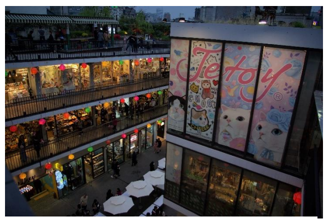
Exploring Daejon, South Korea

I successfully applied for a Travel Grant to allow me to attend the Keystone Symposium Small Regulatory RNA meeting in Daejeon this April. The Keystone Symposia on Molecular and Cellular Biology is a non-profit American organisation with almost 50 years of experience providing conferences, which are among the most prestigious conferences in biology. At this meeting, world-leading experts on short non-coding RNAs met to discuss recent developments and cutting-edge methods in the field. Although I have attended numerous national conferences on cancer research, this was my first international conference and my first on RNA biology.