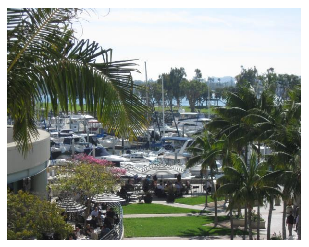
The view from the Conference venue. Because science has to have some perks.

insights into how my work may fit into the wider context of current knowledge. Despite my presentation being the last in the conference, and therefore my spending most of the week in a state of moderate to high nervous tension, I also had the opportunity to attend a large number of presentations and posters and to discuss my findings and potential collaborations with scientists. The ARO conference is one of the largest and well attended in our discipline, attendance allowed me to interact with research groups from all over the world.