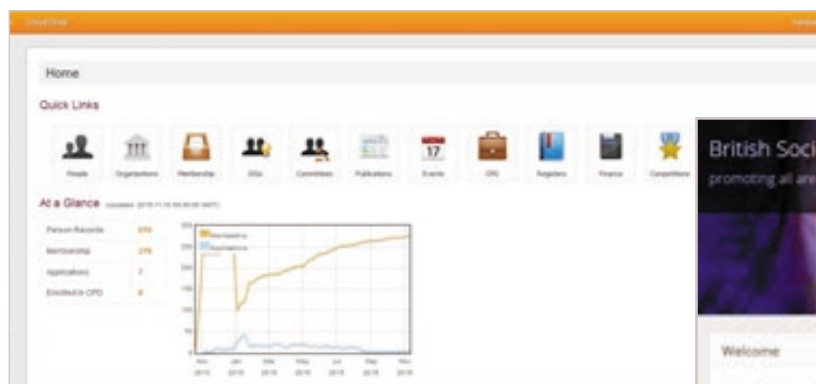
A sample page from our member database

Any changes that a member makes to his/her profile are immediately reflected in their database membership record.